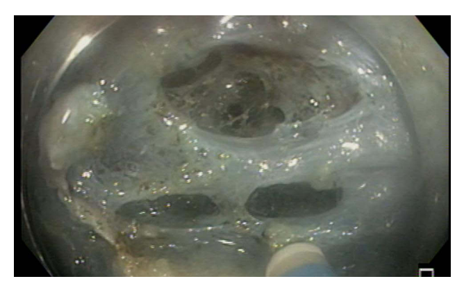
Figure 3 Micro-perforation during colonic ESD.

Prophylactic clipping may be effective in preventing delayed bleeding and perforation after colonic EMR and ESD. In a multicenter study of 2263 EMRs from May 2013–July 2017 in Spain, with prophylactic clipping, the rate of delayed bleeding decreased from 4.5% to 2.2% in the total cohort and from 13.7% to 5.7% in the high-risk group. <sup>101</sup> Post-ESD coagulation of visible vessels has also