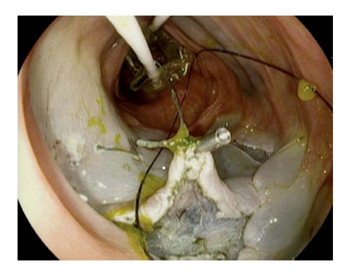
Figure 2 Traction with flexible grasper and DIEP for traction during ESD.

Another method to facilitate ESD, especially in challenging situations such as large lesions, severe fibrosis, fatty infiltration or evidence of tattoo in the submucosal layer, is underwater ESD. Nagata described successful enbloc resection of 24 colonic lesions up to 30 mm without any associated major complications such as perforation. One advantage of this techniques is the "buoyancy effect" which means opening of the mucosal flap aided by subwater emergence. Underwater ESD has been shown to be more effective in en-bloc resection of larger lesions. Hideaki et al also were able to demonstrate that saline-pocket ESD can be performed faster (20.1 vs 16.3 mm²/min) and lead to a shorter procedure time (29.5 vs 41 minutes) in comparison to standard ESD with gas insufflation.