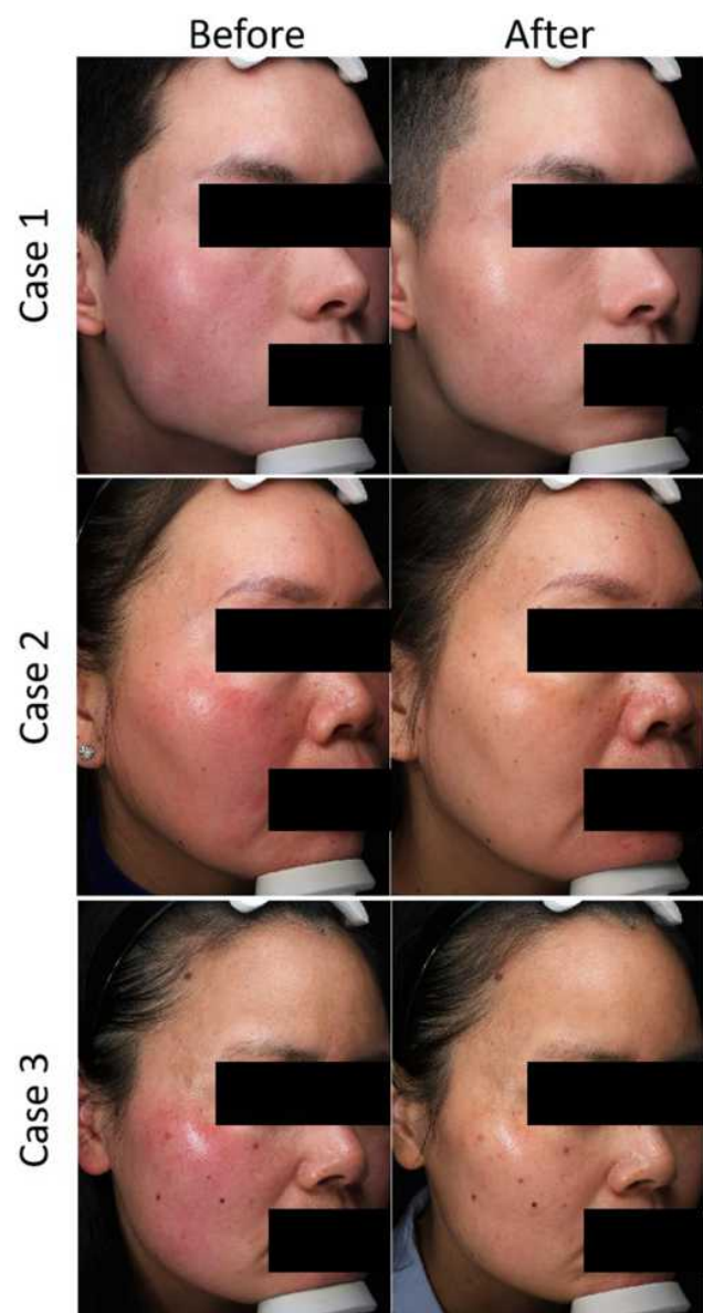
Figure 1 Contrast figures of three cases treated with BTX.

estimated according to the data from the 2019 Yearbook of Health Statistics of China and the 2019 Yearbook of labor Statistics of China. 20,21 All costs in this study are expressed in USD with an exchange rate of USD 1=CNY6.9785 (2019).