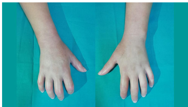
Figure 1 Hands' photograph of the 54-year-old woman shows thickening of the skin, flexion contractures of the interphalangeal joints and oedema.

A 54-year-old woman was admitted to our hospital on April 2018 with a seven-month history of swelling and skin thickening of both hands and forearms (Figure 1), and arthralgia. She had no Raynaud's phenomenon (RP), digital tip ulcers, pitting scars, dysphagia, and dyspnea or sicca syndrome. Physical examination showed an afebrile patient, without synovitis or lung crackles. Her modified Rodnan's total skin thickness score (MRSS) was 12. Her history disclosed left breast intraductal comedonic-type carcinoma diagnosed in 2002 (p53 positive, estrogen receptor negative, progesterone receptor negative, erbB2 negative), TNM classification (extension, lymph node involvement and metastasis): pT1a, pN1mi, pMx. She underwent left mastectomy with lymph node resection and subsequent textured bilateral silicone breast implant (SBI). From January to April 2003, she went through chemotherapy treatment according to the FEC regimen (90) given once every three weeks for six cycles (5-fluorouracil 600 mg/mq - epirubicin 90 mg/mq- cyclophosphamide 600 mg/mq). No rupture of SBI was demonstrated by Magnetic Resonance Imaging – MRI (last exam performed in May 2017). Last breast ultrasound assessment revealed mild signs of capsulitis