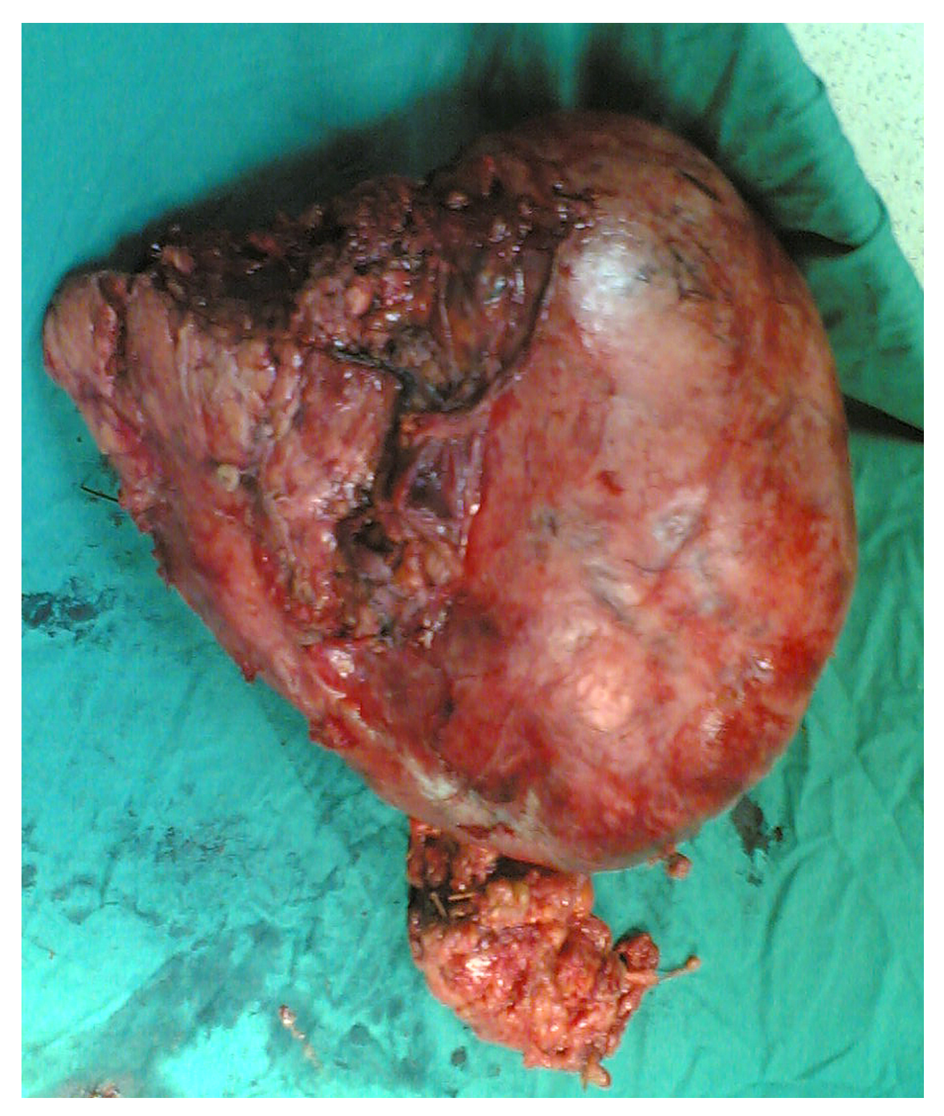
Figure 2 The posterior aspect of a GIST presenting as a huge abdominal mass attached to the left half of transverse colon with its mesocolon, body and tail of pancreas, and a part of the small intestine removed from a 28-year-old female. Abbreviation: GIST, gastrointestinal stromal tumor.