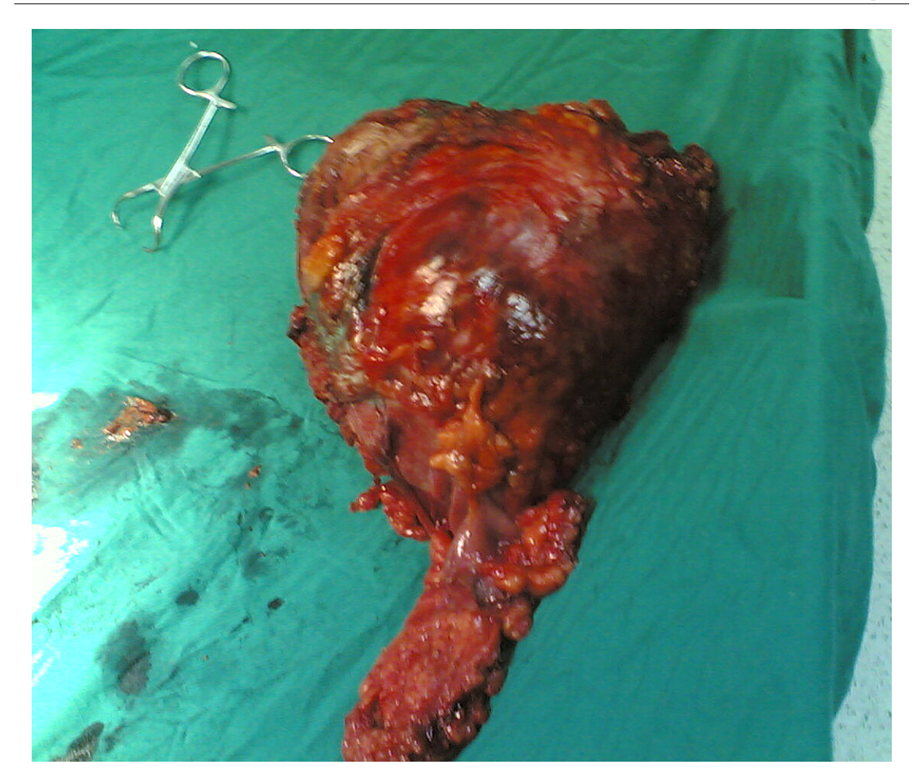
Figure I The anterior aspect of a GIST presenting as a huge abdominal mass attached to the left half of transverse colon with its mesocolon, body and tail of pancreas, and a part of the small intestine removed from a 28-year-old female. Abbreviation: GIST, gastrointestinal stromal tumor.

The mass was tightly attached to these viscera. The spleen was also removed because the splenic vein was ligated as it was traversing the tumor mass.