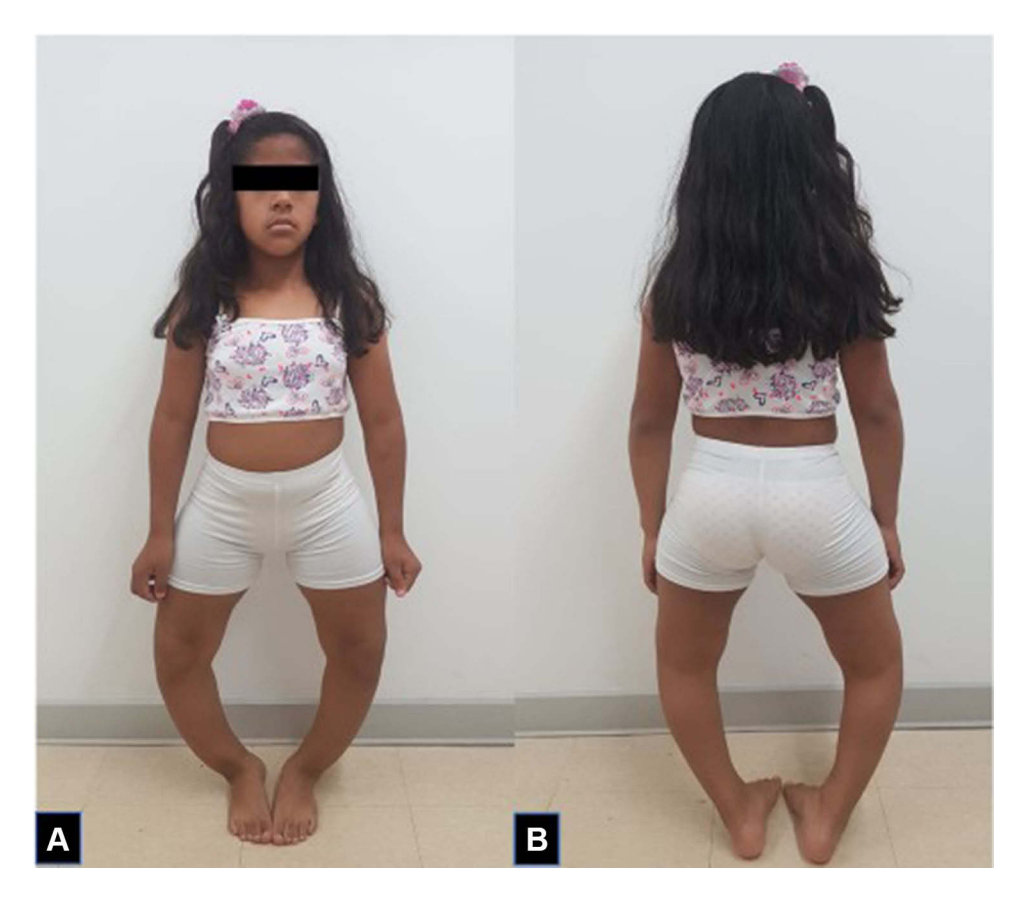
Figure 1 Anterior (A) and posterior (B) view of the patient at 15 years of age.

The clinical result raised the suspicion of XLHR, so sequencing of the gene PHEX was performed. Whole exome sequencing (WES) approach was performed. Approximately 214,000 exons from all encoded sequences were enriched for consensus using genomic DNA fragments of >340,000 probes against the human genome. The sequencing was performed on the Illumina HiSeq 4000