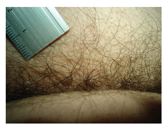
Figure 1a The 42-year-old man is in knee—chest position, head left. He complained of anal itch, bleeding, and pain. Hairs are seen at the buttocks in the uneverted anal region.

intestine may be pulled down towards the patients' head so that the hemorrhoids may be unable to protrude.<sup>1,2</sup> However, it may provide a better field of view on anal and perianal surface than broadly used left lateral Sims' position, as the buttocks fall to each side, and finger tips of both hands of the investigator are free for gentle eversion of the anal skin, which may assist in more differentiated, and therefore more reliable diagnoses in good lighting<sup>1,6</sup> (Figures 1–4).