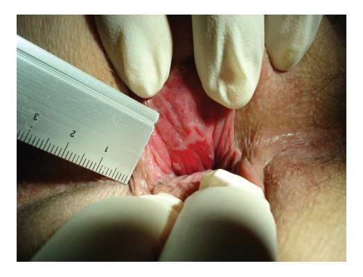
Figure 2b By gentle eversion of the anal tags by the finger tips of both hands of the investigator the dentate line appears with bright red columnar epithelium distally (hemorrhoids). Proximal the dentate line a small superficial split 3 mm to 4 mm in length within the squamous epithelium is seen (superficial fissure).