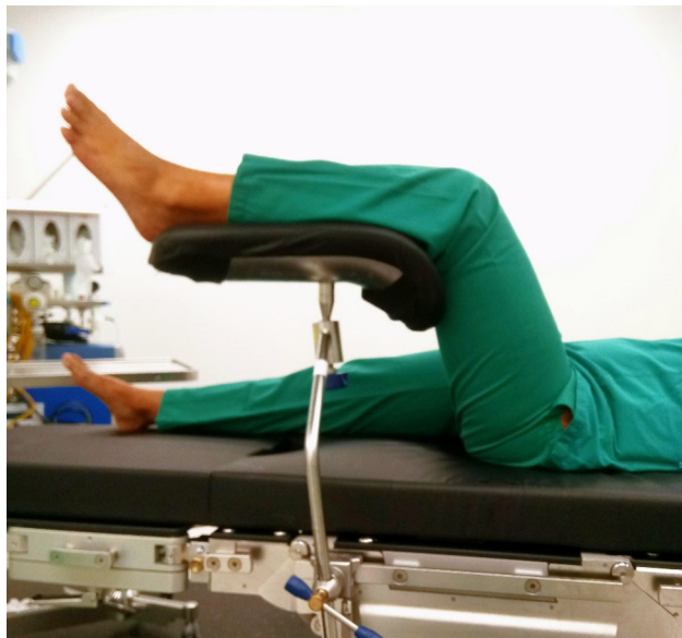
Figure 2 Göpel type support, example of which was used for our cases photography taken by the authors in the Operation room with authorization of the heads of department and the institution.

decreases the perfusion pressure as described by Meyer et al, who carried out dynamic pressure measurement of pressures in each compartment of the leg in healthy subjects when lying flat, compared to when positioned on a classical leg support. 18