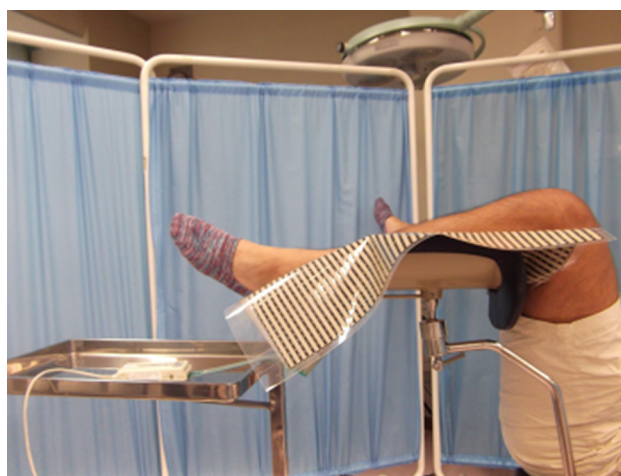
Figure 4 Male sex, height, weight, and body mass index can increase external pressure to calf region using knee-crutch-type leg holder system in lithotomy position. Note: Copyright ©2016. Dove Medical Press. Mizuno J, Takahashi T. Male sex, height, weight, and body mass index can increase external pressure to calf region using knee-crutch-type leg holder system in lithotomy position. Ther Clin Risk Manag . 2016;12:305–312.

Mizuno and Takahashi studied the relationship between the external pressure applied to the leg and certain physical characteristics. 21 The external pressure measurement was a noninvasive alternative to intramuscular pressure measurements. Twenty-one Japanese volunteers aged between 20 and 22 years and in good general health, with an average BMI of 21.4 \text{ kg/m}^2 took part in the study. Diabetics and those with neuromotor problems were excluded. The team used a knee crutch-like holder which corresponds to the support used in our cases (Figure 4) on which they placed a pressure-sensitive measuring mat (BIG-MAT) which was