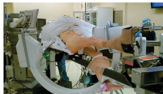
Figure 3 Well leg positioning on a fracture table: using a pillow sling.

Note: Photographs used with permission from Am J Orthop . 2014 December;43:571–573. ©2014 Frontline Medical Communications. 19