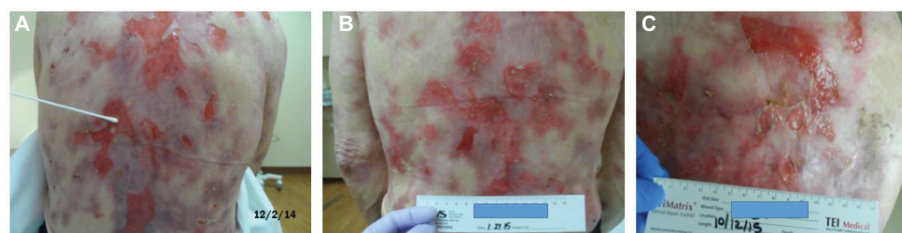
Figure 2 Wound response: central mid-back ulceration.

Note: (A–C) show improvement progress from baseline February 12, 2014 to February 10, 2015.