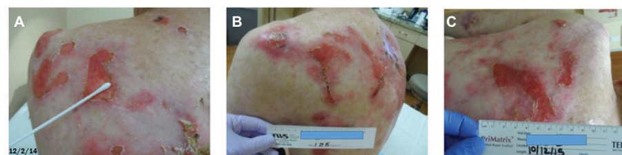
Figure 3 Wound response: distal mid-back ulceration.

Note: (A–C) show improvement progress from baseline February 12, 2014 to February 10, 2015.