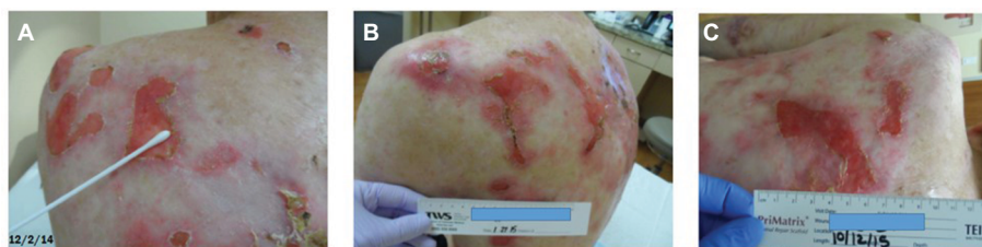
Figure 4 Wound response: left shoulder blade ulceration.

Note: (A–C) show improvement progress from baseline February 12, 2014 to February 10, 2015.