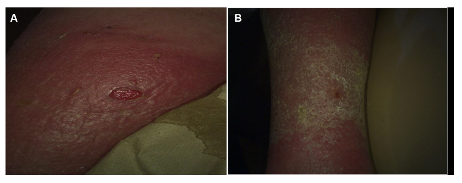
Figure 3 Case 3 venous leg ulcer. Note: (A) Day 0, 1.0 cm<sup>2</sup>; (B) day 14, 0 cm<sup>2</sup>.