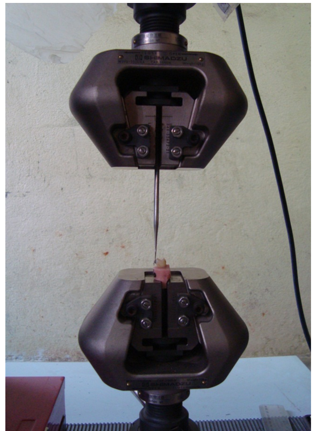
Figure 2 Close view of crosshead of universal testing machine with sample in situ.