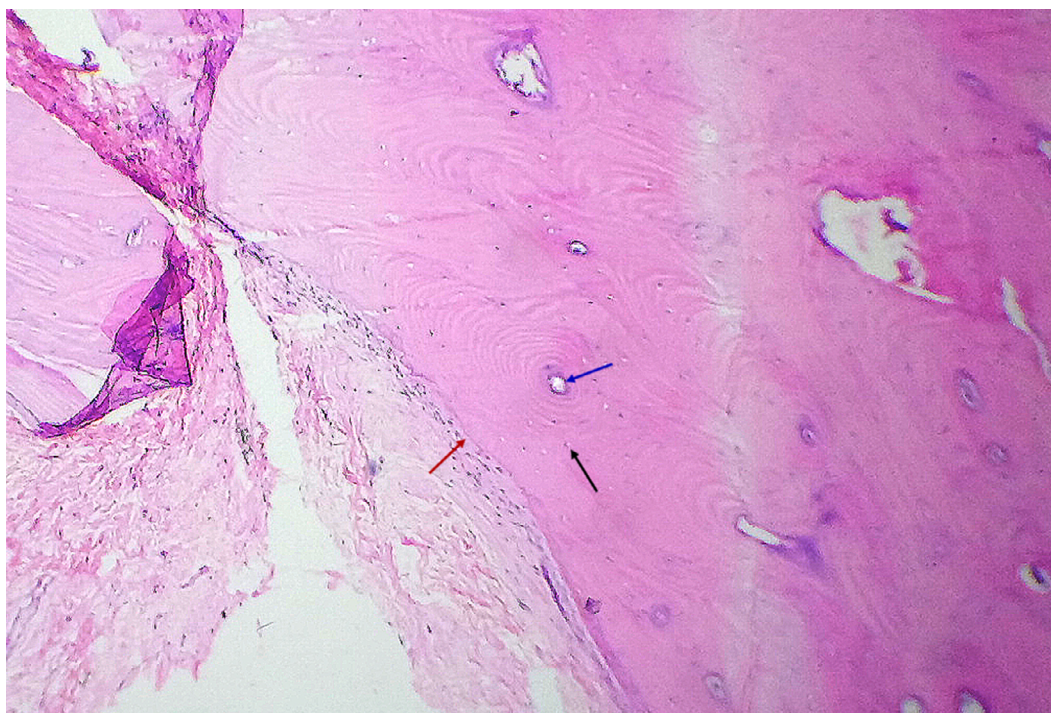
Figure 2 The pathologic section of the mass – well-defined nodule of the bone tissue with Haversian canals and surrounding lamellae (blue arrow) and osteocytes (black arrow). The junction between the conjunctiva and bone tissue is shown by a red arrow.

or have dense attachments to the underlying sclera. Osseous choristomas most likely represent congenital lesions with a potential for slow growth, but may occur in association with trauma. 6