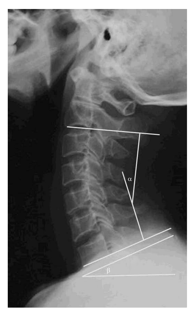
Figure I The FSU angle (\alpha) was examined on lateral radiographs and was formed by lines drawn at the superior endplate of the cephalad vertebral body and at the inferior endplate of the caudal body. The distance (\beta) between the vertebral endplate and implant shell on the lateral view was measured. Abbreviation: FSU, functional spinal unit.

by the tangent lines drawn at the superior endplate of the cephalad vertebral body and at the inferior endplate of the caudal body. The range of motion (ROM) was determined by drawing lines between the superior endplate of the adjacent cephalad vertebral body and the inferior endplate of the adjacent caudal vertebral body in dynamic flexion/extension lateral images.