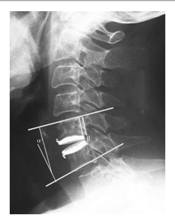
Figure 2 The TI slope ( \alpha ) was measured as the angle between a horizontal line and cephalad endplate of TI in standing lateral radiographs. SACS ( \beta ) was defined as the angle formed by the caudal endplates of C2 and C7 in standing lateral radiographs. Abbreviation: SACS, sagittal alignment of the cervical spine.

Statistical analyses were performed using SPSS software (SPSS Inc., version 22.0; Chicago, IL, USA). The significance of differences between measurements taken at baseline and at final follow-up was analyzed using the paired sample t -test. The independent t -test or chi-square test were used to identify significant differences between groups. Multivariate