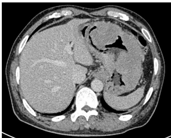
Figure 1 CT of the neck, chest, abdomen, and pelvis showed a tumor in the stomach (5×6 cm) with perigastric lymphadenopathy. Abbreviation: CT, computed tomography.

lactate dehydrogenase, were normal. Computed tomography of the neck, chest, abdomen, and pelvis showed a tumor in the stomach (5×6 cm) with perigastric lymphadenopathy (Figure 1). A diagnosis of lymphoma or gastric cancer was considered likely. Biopsy of the tumor with gastroendoscopy was performed and showed ALCL. Lymphoma cells were positive for CD30, CD2, CD43, LCA, EMA, PAX5, and MUM1 and were negative for CD20, CD3, ALK, CD79a, CD10, Bcl6, CD68, MPO, CK, CD34, and CD138 (Figure 2). The positive ratio of Ki67 was ~80%. Bone marrow aspiration and trephine biopsy showed no infiltration. A diagnosis of primary gastric ALK-negative ALCL was made. Although, first, he was treated with four cycles of CHOP regimen (cyclophosphamide, doxorubicin, vincristine, prednisone), the lymphoma lesions increased in size. Then he underwent two cycles of Hyper-CVAD/MA regimen (hyperfractionated cyclophosphamide, vincristine, doxorubicin, and dexamethasone/methotrexate and cytarabine). After high-dose chemotherapy, the patient had severe bone marrow suppression. Blood transfusion and anti-infection treatment were given. However, he died of disease progression 3 months later.