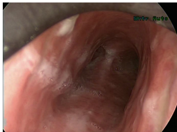
Figure 2 Bronchoscopic findings after chemotherapy and radiotherapy.

Primary tracheal malignancies are rarely observed, as they most commonly result from direct spread of neighboring tumors. SCC along with adenoid cystic carcinoma make up approximately two-thirds of adult primary tracheal tumors, with an incidence of approximately 0.1 in every 100,000 persons per year. 1 Recurrent respiratory papillomas are benign tumors caused by HPV types 6 and 11, with an incidence of 1.8 in every 100,000 persons per year. 2,3 They usually occur in children <5 years (juvenile-onset RRP), and less commonly in elderly patients between the 3rd and 4th decade of their lives (adult-onset RRP). 1 RRP malignant degeneration