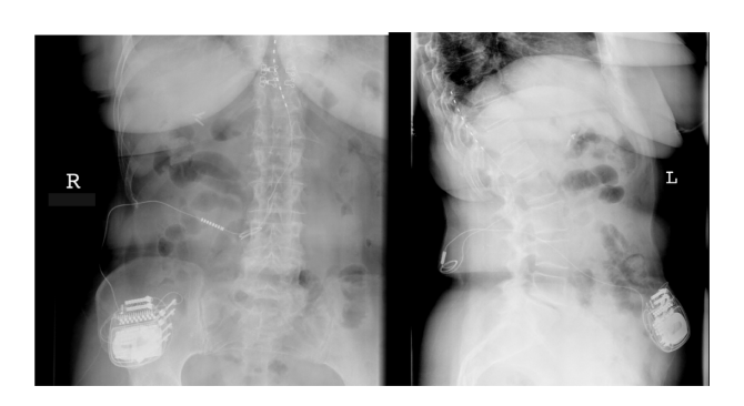
Figure 2 Anteroposterior and lateral view of a thoracolumbar spinal cord stimulation placement; the 8-pole lead (octrode) is positioned at level TH10-12, and the impulse generator is placed abdominally subcutaneously. Abbreviations: R, right; L, left.