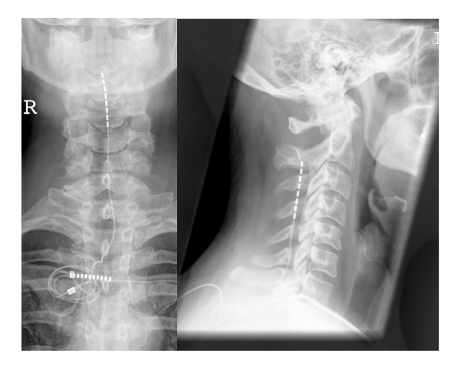
Figure 3 Anteroposterior and lateral view of a cervical spinal cord stimulation placement; the 8-pole lead (octrode) is positioned at level C3-5, and the spinal canal is entered at level TH2/3. Abbreviation: R, right.

paresthesia was necessary to obtain a pain-relieving effect. Furthermore, unlike "conventional" SCS, not only leg pain but also back pain was relieved.<sup>35,36</sup>