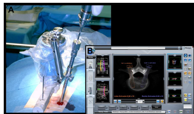
Figure 3 (A and B) Intraoperative setup of the Renaissance miniature robot (Mazor Robotics, Caesarea, Israel).

Navigation-based techniques have been shown to increase the accuracy rate in pedicle-screw placement, 24,25 even in the case of pediatric spine surgery. 26 In the review cited earlier, Gelalis et al 9 found that CT- and fluoroscopy-based navigation increased the accuracy rate of implants to 89%–100% and 89%–92%, respectively. Tian et al found likewise in their review summarizing 43 studies a significantly increased accuracy rate of navigated pedicle screws. 27 In contrast to Gelalis et al, they found 3-D fluoroscopy-based navigation to be slightly more accurate than CT or 2-D fluoroscopy-based navigation, 27 while Mason et al found 3-D fluoroscopy-based navigation to be significantly more accurate than 2-D fluoroscopy-based navigation or conventional fluoroscopy. 28 Studies furthermore showed that the application of navigation