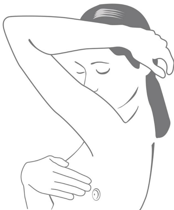
Figure 1 DuoFertility® sensor.

A total of eight patients were recruited for the study. Written consent was obtained from all participants in accordance with the approval from the research ethics committee. Women were advised to start testing their first morning sample of urine using luteinizing hormone tests (ClearBlue® ovulation test; Swiss Precision Diagnostics GmbH, Geneva, Switzerland) on day 8 of their cycle and to come for an ultrasound scan on the day of the first positive ovulation test. Transvaginal ultrasound scanning was repeated daily until evidence of ovulation was obtained in the form of collapse of a previously seen follicle. A maximum of four ultrasound scans per cycle was performed on each patient. The presence or absence of free fluid in the pouch of Douglas was noted. Serum progesterone was measured 3–10 days after the presumed date of ovulation. All but three scans of