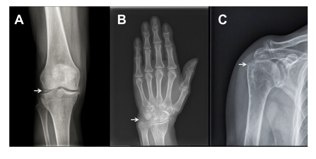
Figure 2 Radiographic CC.

According to EULAR recommendations, US can demonstrate CPP crystals in peripheral joints, appearing typically as thin hyperechoic bands within hyaline cartilage and hyperechoic sparkling spots in fibrocartilage<sup>2</sup> (Figure 3). An Italian expert group performed a case-control study to assess the utility of US in the diagnosis of CPPD.<sup>17</sup> They found that CPP crystals were present in SF of all patients with CPP deposits defined by US. In only two patients, X-ray examinations not confirm the calcific deposits previously identified by US. The authors concluded that US patterns used in the study (as mentioned earlier in this paragraph) had a very high correlation with the presence of CPP crystals in SF and suggested that US may have at least an equal sensitivity and specificity to that of X-ray plain film in identifying CPP crystal calcifications.<sup>17</sup> Moreover, a longitudinal study enrolled patients with ultrasonographic signs of CC, according to previously proposed criteria and