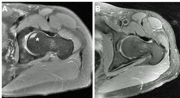
Figure 2 Preoperative magnetic resonance image (A) from a patient with an avascular necrosis lesion at the femoral head (star). The patient underwent minimally invasive core decompression with injection of autologous concentrated bone marrow aspirate and noted a significant reduction in pain. Follow-up magnetic resonance imaging 2 years following decompression and concentrated bone marrow injection showed complete resolution of the avascular necrosis lesion (B).