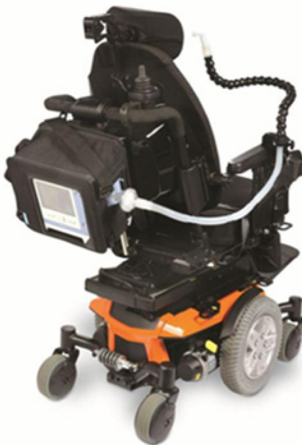
Figure 5 Support arm on the Trilogy ventilator (Philips Respironics Inc., Murrysville, PA, USA) to hold a mouthpiece for daytime ventilatory support.

Nasal NVS is most practical for use during sleep, but it is also indicated for infants and for those who cannot grab or retain a mouthpiece because of oral muscle weakness, inadequate jaw opening, or insufficient neck movement.