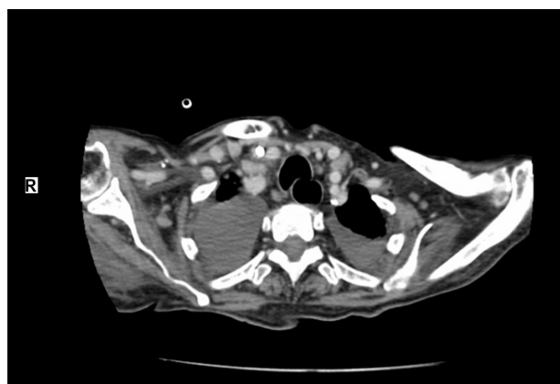
Figure 1 Computed tomography of neck; lymphadenomegalies in various dimensions.

Computed tomography demonstrated generalized lymphadenopathy in the axillae, cervical area, paraortic areas, inguinal area, and mediastinum.