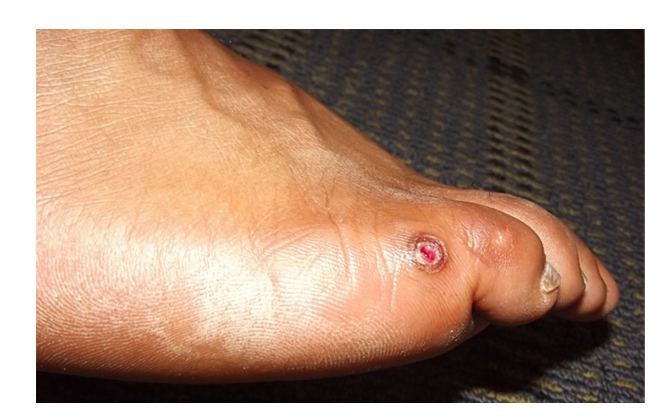
Figure 2 Circular ulcerous furuncular lesion of the lateral dorsum of the right foot, adjacent to the base of the fifth toe, 24 hours following the removal of a prepupal larva of the tumbu fly, Cordylobia anthropophaga .

The African tumbu fly (also known as the mango fly and putzi fly) is responsible for the majority of furuncular lesions in Sub-Saharan, Central, and West Africa. 1-3,6,11-13 Infestation in humans by larvae of the tumbu fly was first described in a patient from Senegal in 1862. Female tumbu flies normally oviposit between 100–300 eggs, usually in an aggregate mass, in sandy soil or sod contaminated with animal feces, urine, or garbage. The hatched larvae can remain viable in the soil for 9–15 days, until at which time they need to find a host for further development. The tumbu fly may deposit eggs on clothing that has been spread on the ground to dry, on improperly washed diapers placed in the shade to