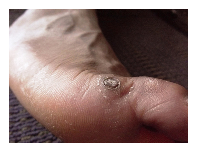
Figure I Circular ulcerous furuncular lesion of the lateral dorsum of the right foot, adjacent to the base of the fifth toe, containing a compressed prepupal larva of the tumbu fly, Cordylobia anthropophaga.

During the summer of 2012, a 26-year-old male medical student visited Ntagatcha, Tanzania for a medical mission trip. Three weeks following his return to the United States, he noticed a scab developing on the side of the fifth digit on his right foot (Figure 1). He dismissed the scab as a simple corn or callus, which he thought was a result of his close fitting shoes and soccer cleats. One month later, he noticed that the scab became raised and sore with activity. One week later he noticed the scab looked greenish and decided to remove its top layer. Instead, an entire plug of