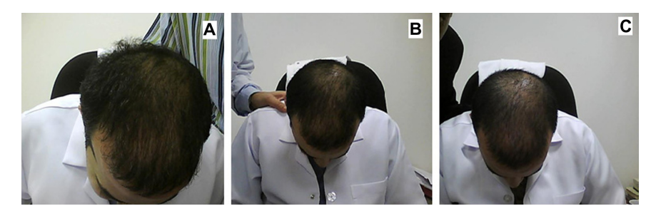
Figure 7 Representative photographs of a subject with frontal alopecia treated with placebo. (A) Baseline, (B) at week 8 (slight decrease in hair growth), and (C) week 16 (moderate decrease in hair growth).