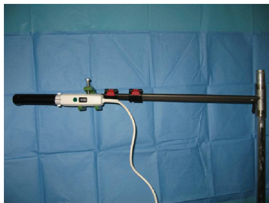
Figure 2 Ultraviolet A lamp held by a clamp mounted on an intravenous pole.

Thus far, we have successfully treated 12 patients with progressive keratoconus using this ultraviolet A lamp and riboflavin 0.1% solution (Figure 4) prepared inhouse. Visual acuity remained stable in all cases after 6 months. Stabilization of corneal topography was observed in all