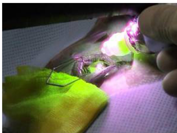
Figure 4 Performing collagen crosslinking in a progressive keratoconus patient with the modified ultraviolet A lamp and the self-made riboflavin 0.1% solution at 3.5 cm from the cornea.

The price of a commercially available ultraviolet A lamp designed for collagen crosslinking is approximately €15,000, and the riboflavin solution prepared inhouse costs approximately €60 per patient. The price of the slightly modified ultraviolet A dermatological lamp we used is approximately