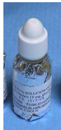
Figure 3 Riboflavin 0.1% solution in a 15 mL balanced salt solution bottle wrapped in aluminum foil to avoid exposure to ambient light.

patients after 6 months. No side effects were detected in the early postoperative period or after 6 months.