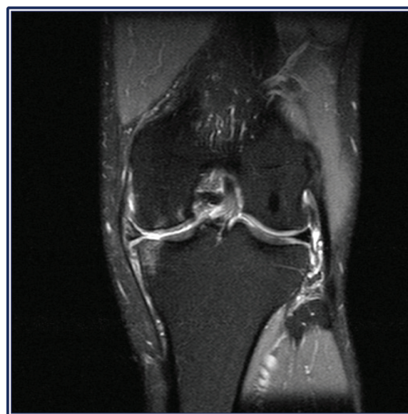
Figure 3 Magnetic resonance imaging of the left knee demonstrating a medial meniscal tear, herniation from the joint space with bone edema within the medial tibial plateau, and osteochondral damage on the medial femoral articular surface.

unstable chondral femoral flap. The patient returned 3 months later reporting that knee joint catching had improved although medial pain in extension during weight-bearing activity persisted. He also reported discomfort when walking distances and stated that he could not return to tennis because