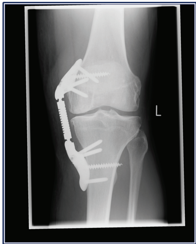
Figure 4 Weight-bearing radiograph of left knee demonstrating successful initial KineSpring® System.

The patient underwent implant with the KineSpring System in July 2011. Arthroscopy was undertaken prior to implant, which confirmed grade 4 lesions on the medial femoral condyle and the medial tibial plateau. The KineSpring procedure followed standard techniques that have been described elsewhere 11 and was uneventful (Figure 4). The patient remained hospitalized for 2 days following the procedure. Although he was allowed to bear partial body weight and perform gentle range of motion exercises, he was instructed to walk with crutches for 2 weeks to encourage wound healing. The patient reported immediate arthritic pain relief in the postoperative period. At the 2-week follow-up, the wound was fully healed and range of motion was 90 degrees. He was encouraged to engage in only light