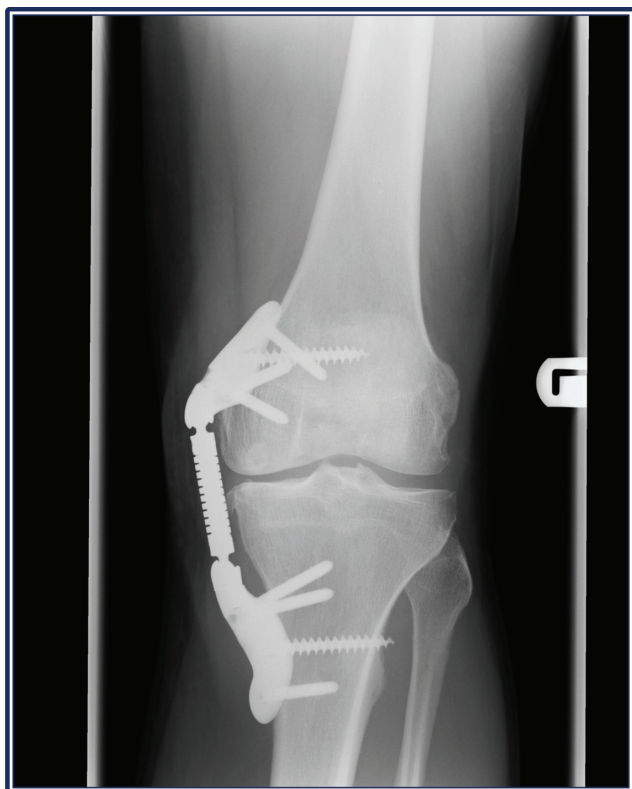
Figure 5 Weight-bearing radiograph of left knee demonstrating successful KineSpring® System following two-stage revision procedure.

with no complications. Postoperatively, the patient was instructed to gradually increase ambulation with the assistance of crutches while using minimal knee bending. The patient returned for follow-up visits weekly, which included visual inspection and microbial swabs of the wounds, until complete wound healing was realized. At 6 weeks, there was no evidence of infection, the wounds were well healed, and radiographs were unremarkable. At 3 months, the patient reported no wound problems, complete resolution of arthritic pain, and 120 degree range of motion with normal ambulation. Despite residual muscle weakness, the patient regularly engaged in moderate physical activity including walking, cycling, and tennis with no reported complications, pain, or joint dysfunction.