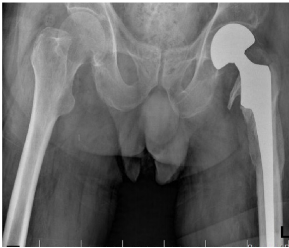
Figure 4 On the control visit at year 2, it was seen that the osteolytic area had completely recovered.