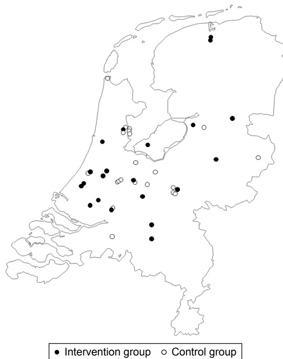
Figure 2 The ADAPT study locations in the Netherlands. Abbreviation: ADAPT, ADolescent Adherence Patient Tool.

of follow-up. 27 To detect a relevant difference ( >1.5 \pm 4.0 ) in MARS scores with a power of 80%, a significance level of 95%, and accounting for 35% dropout, 151 patients per group (intervention and control) are required. As a cluster randomized design is used, a correction factor of 1.16 is needed, based on inclusion of 10 patients and variation of 0.25 per pharmacy. This results in a sample size of 175.2 patients per group; thus, a total of 352 patients have to be included. Based on previous experiences, we estimate that ~25–30 patients per pharmacy will meet the inclusion criteria; therefore, inclusion of 10 patients per pharmacy should be feasible.