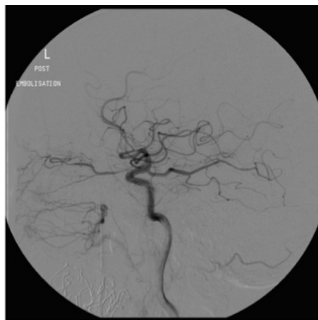
Figure 3 Post-embolization angiogram showing absent communication of carotid artery and cavernous sinus (ie, carotid-cavernous fistula closed).