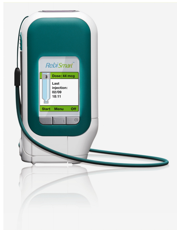
Figure 1 The RebiSmart™ device.

This was a Phase IV, observational, open-label, multicenter study of patient use of and response to an electronic auto-injection device in the UK and Ireland (NCT01195870). Patients who were treatment-naïve to sc IFN \beta -1a (Merck Serono S.A., Rebif®; Geneva, Switzerland) were given the