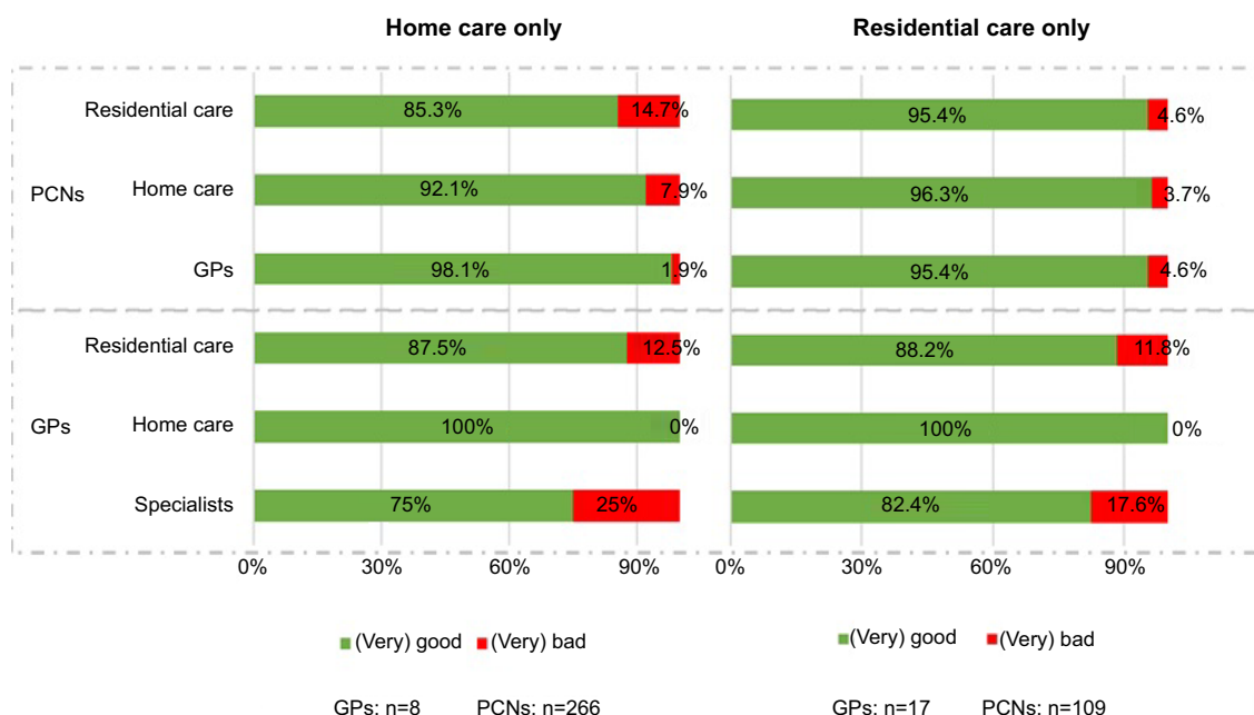
Figure 3 Dichotomized quality of communication of GPs and PCNs across different settings. Abbreviations: GPs, general practitioners; PCNs, primary-care nurses.