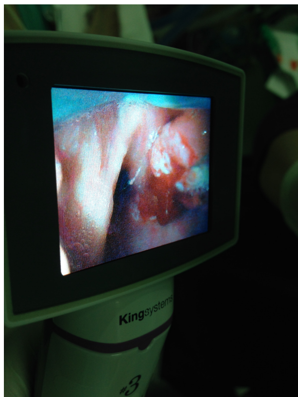
Figure 1 Picture of visualization of the tumor obscuring the entrance to the larynx using the KingVision™ video laryngoscope (King Systems, Noblesville, IN, USA).

A size 7.0 endotracheal tube was then introduced into the trachea. General anesthesia was commenced with propofol infusion and maintained with sevoflurane and rocuronium. The surgery and perioperative period were uneventful.