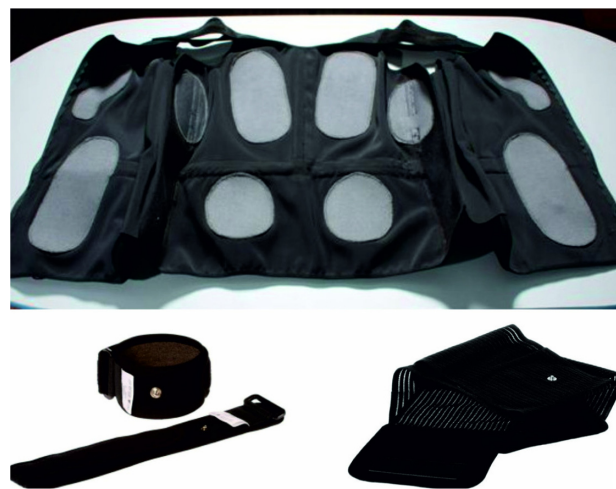
Figure 2 Whole-body electromyostimulation electrodes (vest and sleeves).