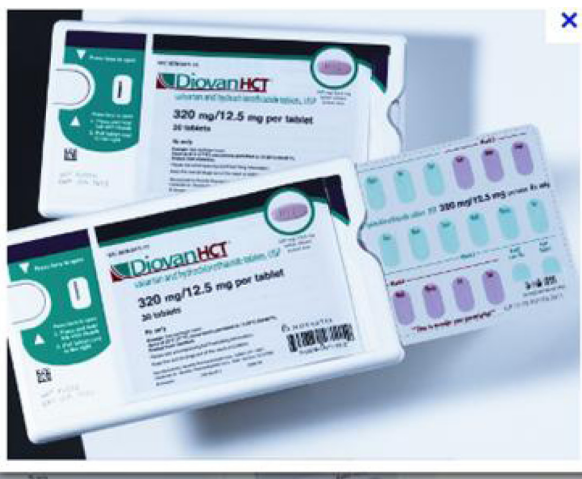
Figure 2 Reminder packaging dispensed to patients.

was provided on the cover for easy recognition. Instructions on how to open the RP were printed on the outside container cover. A reminder to reorder was found inside the blister card insert to prompt the reordering of refills by patients at the end of each monthly regimen.