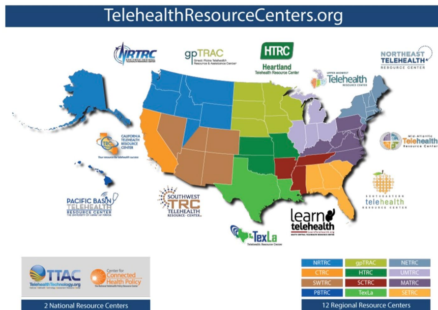
Figure 3 Telehealth Resource Centers in the US and Region Covered.

Note: Reproduced from Center for Connected Health Policy. The National Telehealth Policy Resource Center. The Federally Funded Telehealth Resource Centers. Available From: http://www.cchpca.org/sites/default/files/resources/PERSPECTIVES%20ARTICLE%20CCHP%20-Federally%20Funded%20TRCs%202014.pdf . Accessed May 15, 2017. 64