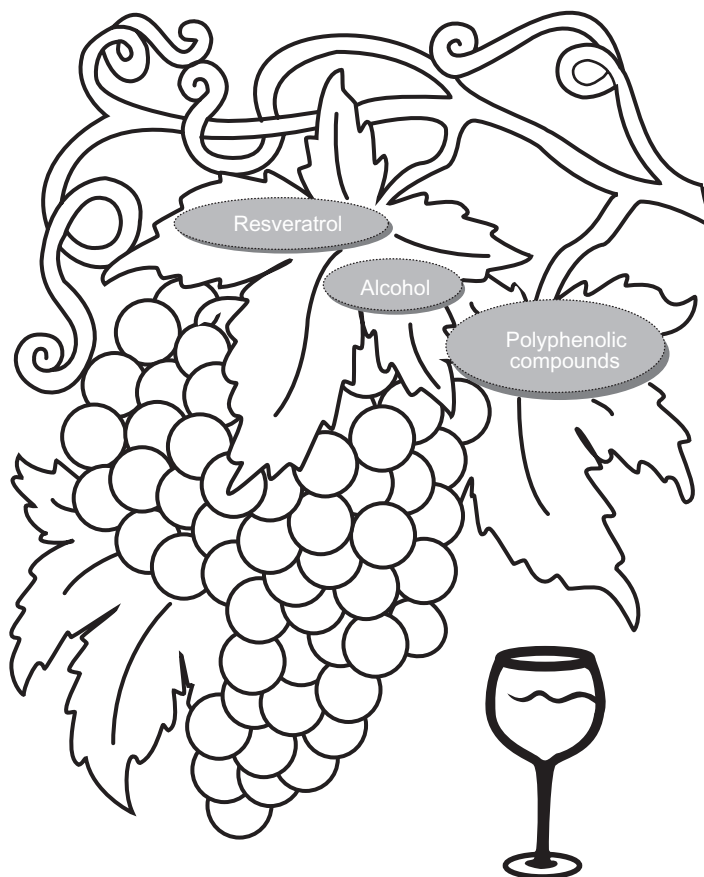
Figure 1 Beneficial effects of red wine components on cardiovascular health.