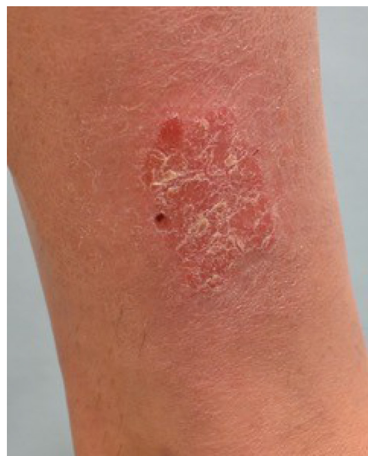
Figure 1 Plaque type psoriasis on lower extremity prior to treatment with excimer laser.

Bonis et al were the first to study the use of the 308 nm XeCl excimer laser in the field of dermatology in 1997. They investigated the use of excimer laser for treatment of 10 patients with chronic plaque psoriasis and concluded that it was an effective treatment option. 15 Since its initial introduction to dermatology, use of the excimer laser as a treatment option has expanded to applications in many dermatologic diseases. Psoriasis treatment with excimer laser has proven to be effective even in early studies with Feldman et al demonstrating 84% of patients achieving a 75% or better improvement after 10 or fewer treatments (Figures 1 and 2). Excimer laser is currently indicated for adult and pediatric patients with mild, moderate, or severe psoriasis with <10% body surface area involvement and the American Academy of Dermatology states the level of evidence is II and the strength of recommendation is B. A literature search on PubMed was used with combinations of the terms "excimer", "excimer