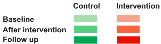
Supplementary 2. The Effectiveness of the intervention on dementia caregivers