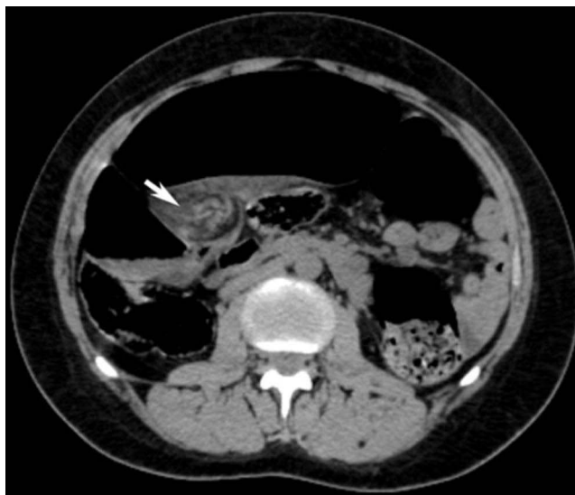
Figure 2 Axial CT image, showing twisting of the ileum with wrapping of the ileum along the base of colon [arrow].

The patient was then kept nil by mouth and resuscitated with intravenous crystalloids; an NG tube was inserted; an indwelling Foley catheter was inserted; and the patient was prepared for surgical exploration after informed written consent was obtained.