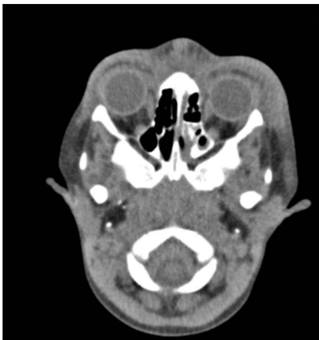
Figure 1 Axial non-contrast orbital CT: bilateral extensive periorbital soft tissue swelling and fat stranding (bilateral orbital cellulitis).

Orbital CT demonstrated extensive bilateral periorbital soft tissue thickening and facial subcutaneous edema (Figure 1). In addition; Contrast enhanced CT of thorax revealed Multiple peripherally located cavitory lesions in the bilateral lungs (Septic emboli) and associated bilateral moderate pneumothorax with consolidation areas with air bronchogram in the left lower lung of the lung (Figure 2).