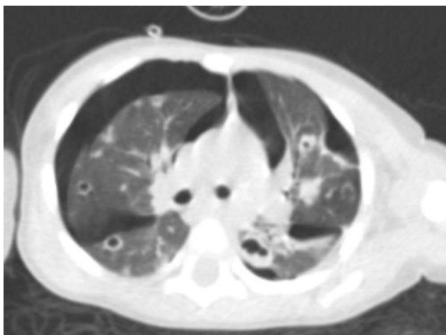
Figure 2 Axial thoracic CT demonstrated multiple peripherally located cavitory nodules in both lungs and moderate bilateral pneumothorax (septic pulmonary emboli complicated by pneumothorax).