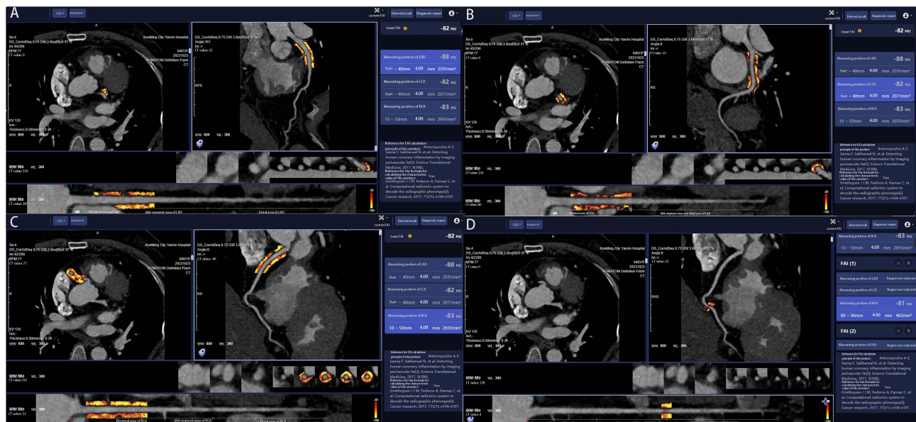
Figure 1 Female, 46 years old, localized non-calcified plaque in mid-segment (segment 3) of the right coronary artery causing mild luminal stenosis (approximately 45% narrowing), Gensini score of 2. (A) Proximal section of LAD (start=40 mm), FAI value of -88 hU, volume of 2591 mm 3 , thickness approximately 4.00 mm; (B) Proximal section of LCX (start=40 mm), FAI value of -82 hU, volume of 2071 mm 3 , thickness approximately 4.00 mm; (C) Proximal section of RCA (start=40 mm), FAI value of -83 hU, volume of 2693 mm 3 , thickness approximately 4.00 mm; (D) Localized non-calcified plaque in the mid-segment (segment 3) of the right coronary artery causing mild stenosis around FAI parameters: FAI value of -81 hU, length approximately 7 mm, volume about 402 mm 3 .

The main coronary artery FAI were calculated automatically. 13,14 After data import, the system measured the length of the three primary coronary arteries, their respective FAI values, and the volume of pericoronary fat. A fat partition threshold of -190 to -30 hU was used to calculate the target fat within a 40 mm range extending outward from the outer edge of the vessel wall. For the left anterior descending artery (LAD) and the left circumflex artery (LCX), the measurement range began at the origin and extended to 4 mm distally, while for the right coronary artery (RCA), it started 10 mm from the coronary ostium and extended to 50 mm distally (see Figure 1).