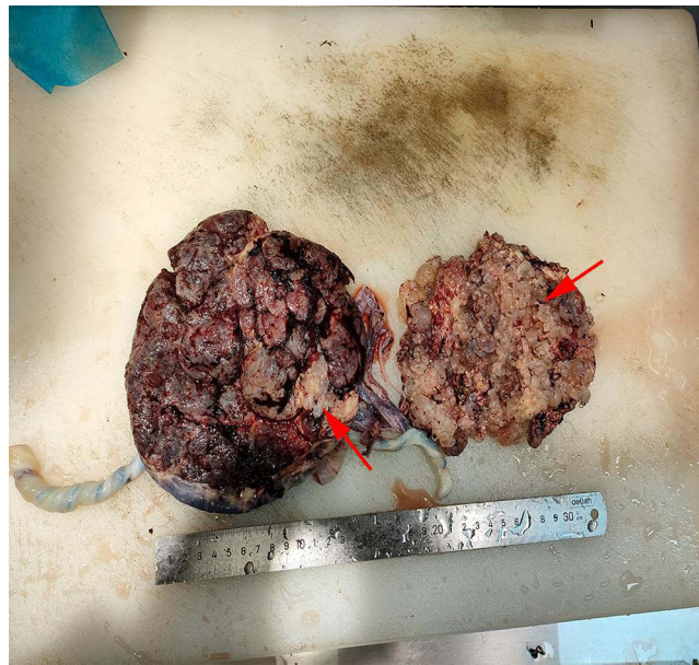
Figure 2 Gross examination: revealed a fused placenta with two umbilical cords attached, with localised vesicular changes and a pile of scattered vesicular tissue (red arrow) (H&E, \times 400 ).