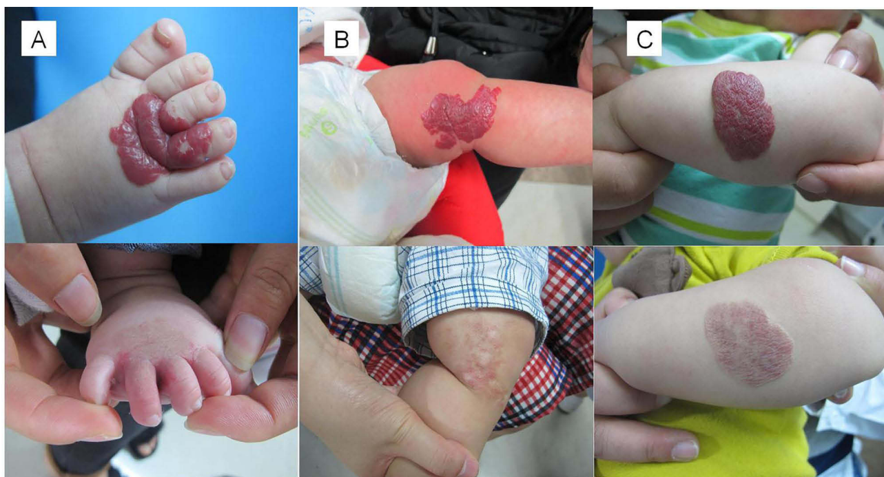
Figure 2 Images of adverse reaction before and after treatment. (A) ≤1M group, after 4 times of combination therapy, the efficacy reached grade IV with minimal hyperpigmentation and recovered at 2 months of follow-up. (B) 3–12M group, after 6 times of combination therapy, the efficacy reached grade IV with hypopigmentation and no recovery after 6 months of follow-up. (C) 3–12M group, after 6 times of combination treatment, the efficacy reached grade IV with residual scar and no recovery after 6 months of follow-up.

months of follow-up, and the remaining skin scars did not recover during the follow-up (Figure 2). In addition, the incidence of adverse reactions among the three groups was compared ( p = 0.281 ), and the difference was not statistically significant. Furthermore, based on the types of adverse reactions, there were 0 permanent and 10 cases of temporary