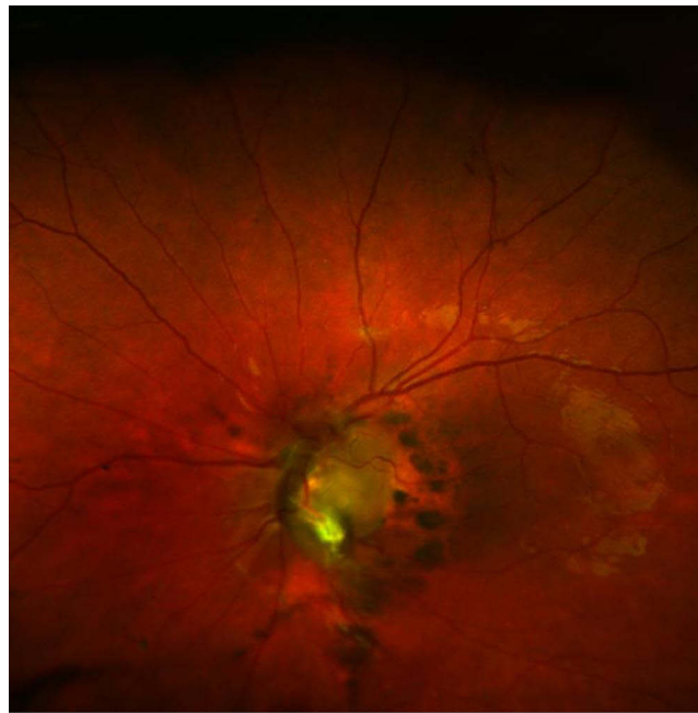
Figure 2 A retinal image captured by Optos ultra-widefield ® presents a 9-year-old male patient with remnants of PFV over disc five years after vitrectomy in left eye (Case 10). Optic nerve head hypoplasia with peripapillary RPE mottling. No peripheral vascular abnormalities. The final visual acuity was 0.05 on Snellen testing.

As anticipated, children presenting with complex PFV with macular TRD exhibited poor visual outcomes following surgery. Among the PFV eyes with associated optic nerve head hypoplasia or macular TRD, the most favorable postoperative visual acuity achieved was finger counting.