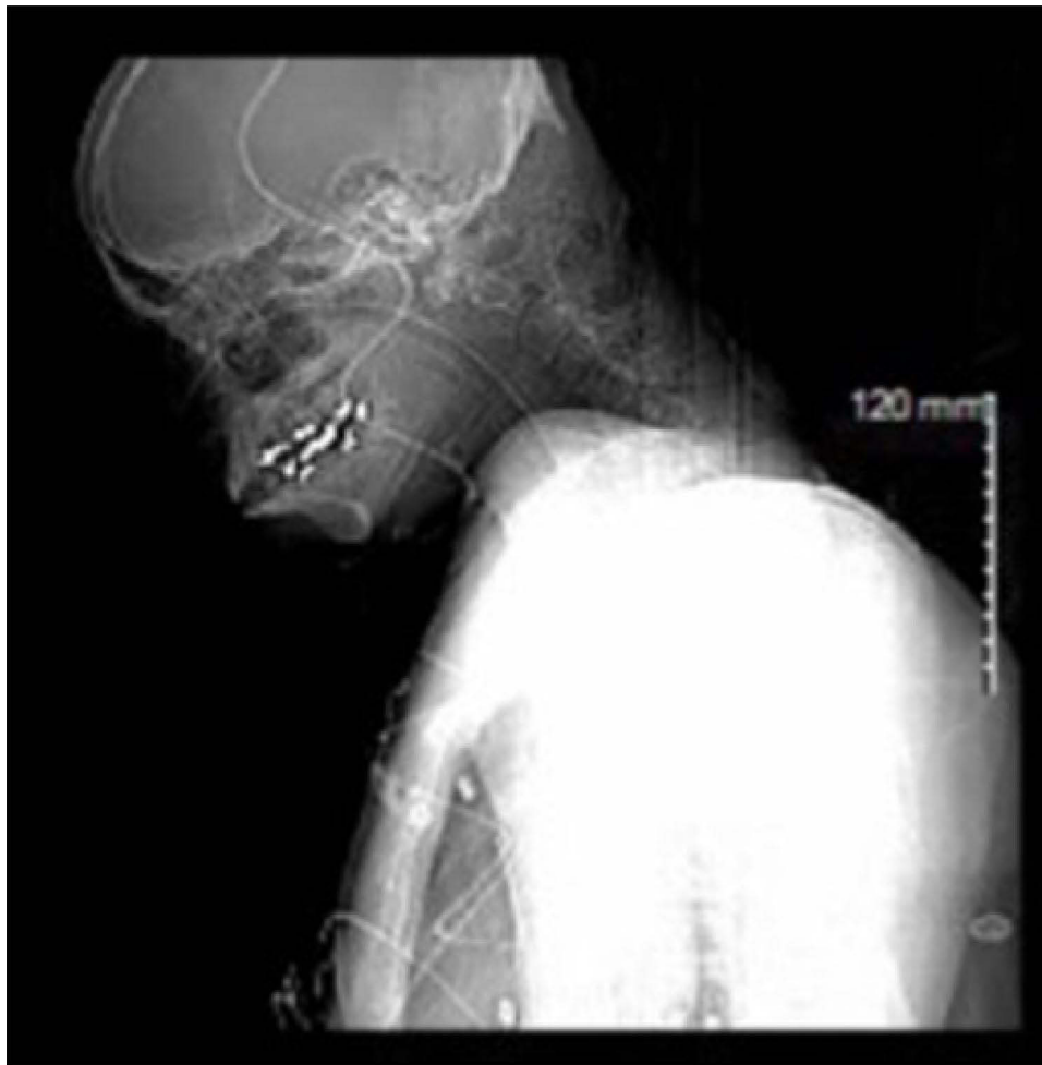
Figure 2 CT scan following admission and 1st intubation in OR.

advancement of the endotracheal tube between attempts and prolonged attempts via passive oxygenation. However, due to the extremely challenging anatomy there was not enough apnea time to fully evaluate the problem. Therefore, the patient was kept nasotracheally intubated and returned to the ICU. A discussion was held with the patient about a second tracheostomy attempt with ECMO to which he agreed.