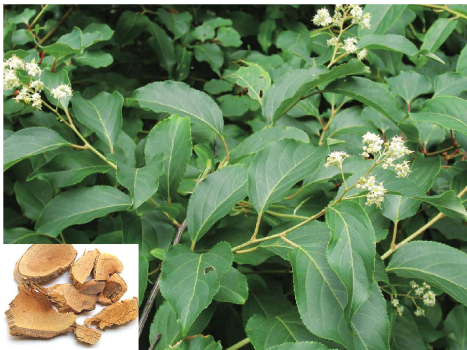
Figure 1 Tripterygium wilfordii Hook. f and its pieces of traditional Chinese medicine.