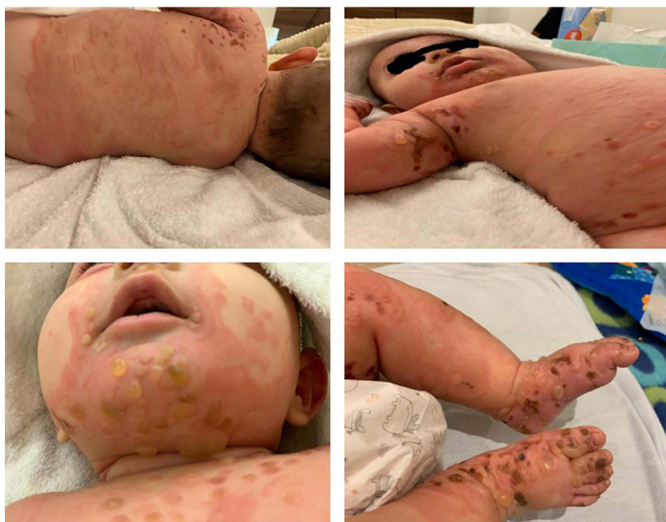
Figure 1 Multiple widespread tense bullae over the entire body, with crusted erosion on the lower limbs.

Considering the clinical presentation and laboratory and pathological results, the diagnosis of IBP was established. The patient was treated with oral prednisolone ( 1 \text{ mg}/\text{kg} ) for 4 months and showed partial improvement. As the child developed new blisters and a few urticarial plaques over the trunk and extremities, topical steroid mometasone was additionally administered ( 1.5 \text{ fingertip units} ) twice daily. Subsequently, as the infant exhibited weight gain (90th percentile) and a blood pressure of 131/81