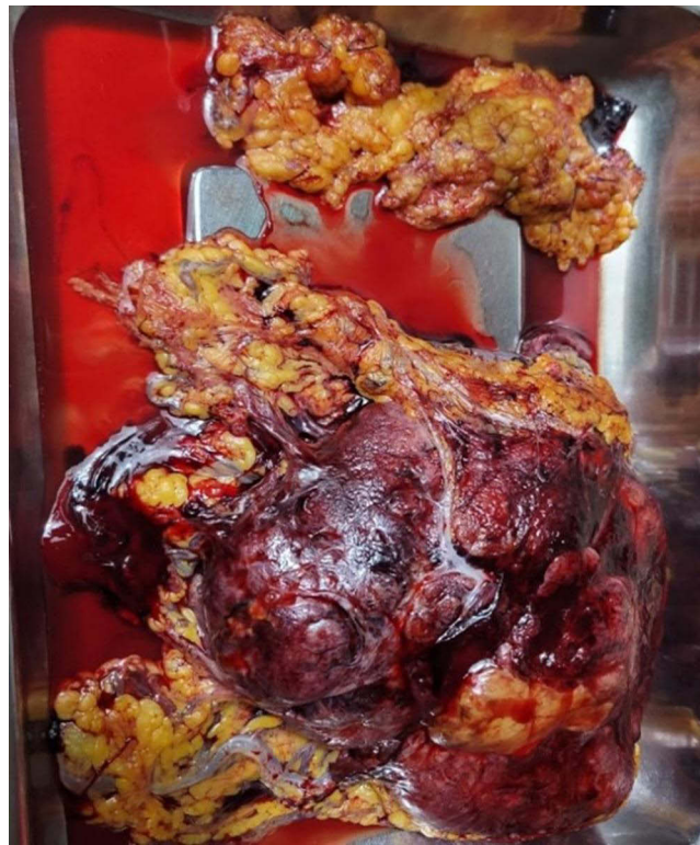
Figure 2 During the surgery, a large mass was discovered that infiltrated the greater omentum.

immunohistochemistry not always a reliable diagnostic tool. 5 On the other hand, hemangiopericytoma cells express antigens such as CD34 (100%), CD99, and Bcl-2 (70–90%). 1,4,8 STAT6 serves as a reliable immunohistochemical indicator for diagnostic purposes, 9 but in our case CD34 was present, whereas STAT6 was not present. In order to identify hemangiopericytoma it is essential to conduct an assessment including running necessary laboratory tests and carrying out imaging studies. 10 Magnetic resonance imaging (MRI) is a more effective tool than using a computer tomographic (CT) scan to assess the size of the tumor and how it interacts with tissues. In our case, we proceeded with the surgery after reviewing the CT scan results as the size of the lesion necessitated surgery due to rupture of tumor with intra-peritoneal bleeding regardless of the result of tumor type. Additionally, our hospital is currently experiencing resource constraints, and many patients are unable to afford extra investigations.