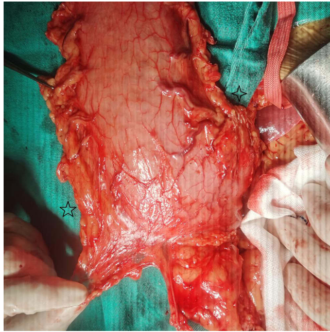
Figure 1 Congenital absence of the right gastroepiploic vessels (RGEVs). *Greater curvature of stomach, *Lesser curvature of stomach.

posterior gastric artery. Subsequently, the blood supply to the gastric remnant was observed for 30 min, and only the right gastric artery was preserved. Intriguingly, because there was no ischemia of the gastric mucosa, a manual gastroesophageal anastomosis was performed via the retrosternal route to the left neck. Furthermore, microvascular anastomosis of the short gastric vein to the left anterior cervical vein was performed for superdrainage (Figure 2). Finally, jejunostomy was performed to provide nutritional support.