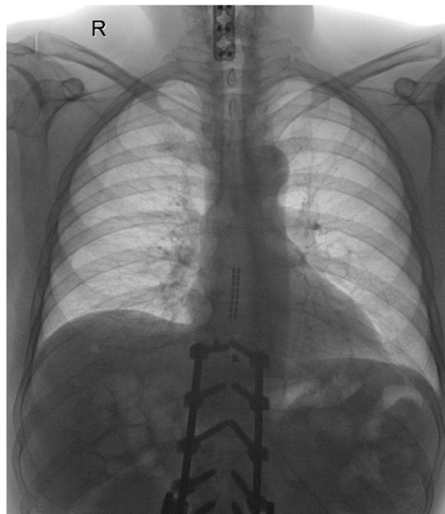
Figure 3 2×8 electrode plate (Artisan™) by Boston Scientific, Massachusetts, USA implanted in a surgical way in a male-patient after traumatic SCI on Th12 level. 1.2kHz SCS without improvement.