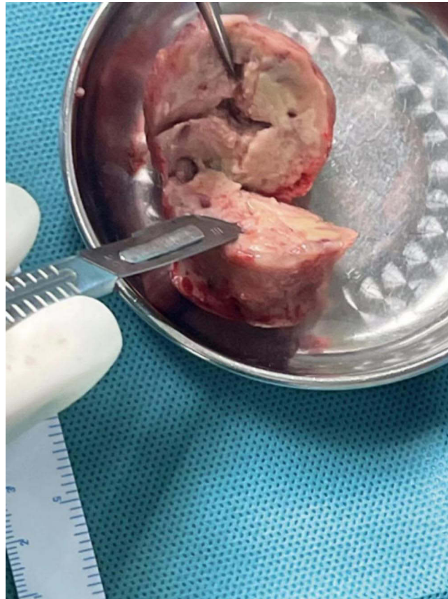
Figure 2 Excised brain mass during surgery.

Surgical incision of the brain mass showed a compact mass (Figure 2). Subsequently, microscopic morphology of Giemsa stain (Figure 3A) lectophenol cotton blue stain (Figure 3B) and culture in SDA (Figure 3C) of the brain mass showed the presence of Talaromyces marneffe . Furthermore, metagenomic next-generation sequencing (mNGS) of the brain mass was conducted, and Talaromyces marneffe (sequence number: 9) and EBV (sequence number: 6054) were identified. Besides the Talaromyces marneffe infection, histopathologic examination of the brain mass revealed B-cell